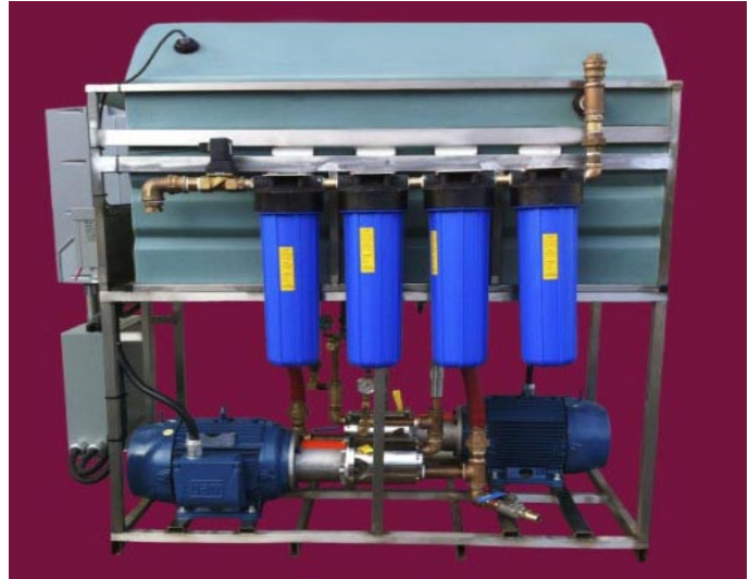
*Unit Size and Structure may vary depending on application requirements

The systems can also be used to reduce the risk of explosions and fire. MEC's "MISTER"™ trademarked products are used worldwide in many industries and applications, including dust suppression in sawmills, humidification for wine barrel storage rooms, and greenhouses, cooling for outdoor patios, poultry farms, zoos, theme parks and special effects. MEC currently has misting systems operating in North and South America, the Caribbean, South Pacific, Europe, the Middle East and the Far East.